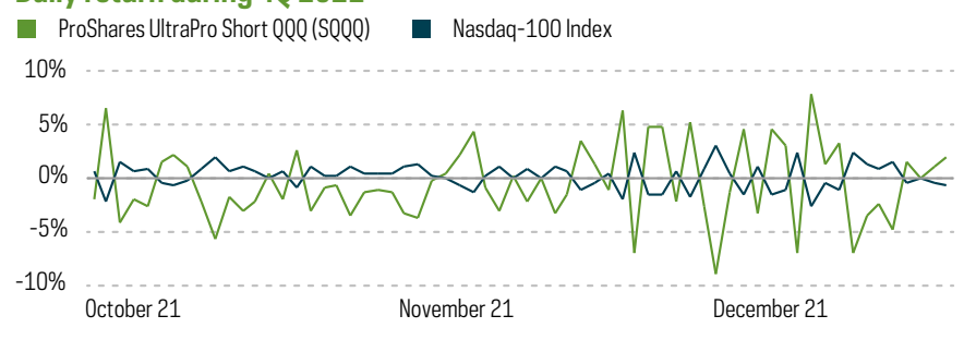
Daily return during 40 2021

The scatter graph charts the daily NAV-to-NAV results of the fund against its underlying index return on a daily basis.